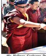
His Holiness Gyalwang Drukpa during his visit to Nang Village.